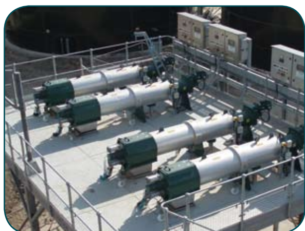
SludgeScreen™ Units Mounted in Parallel

The figures in the tables above are based on flows through a two directional 5 mm perforated screen and should be used as a guide only as other factors such as the content of the coarse material, mineral content, etc. which are site specific will influence the final performance.