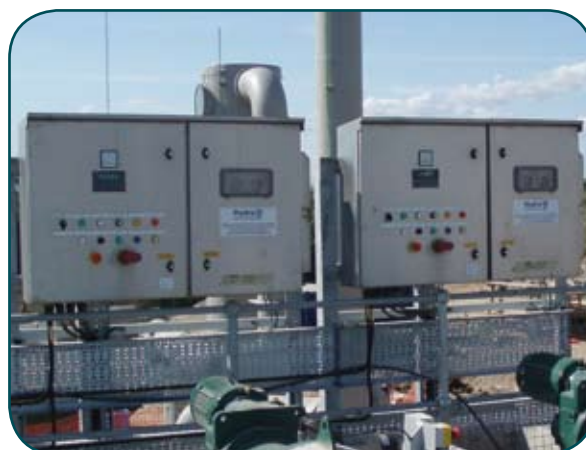
SludgeScreen™ Control Panel

HRD Technologies Ltd is a subsidiary of Hydro International plc.