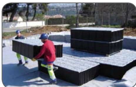
Installation of Stormcell®

The Stormcell® / Stormcell® Lite system demonstrates a major potential reduction in planned maintenance due to the perforated distribution pipes running beneath the storage tank. Any silts, grits or debris are washed through the pipework during the 'first flush' rather than into the tank. The system is therefore effectively maintenance-free. The only part of the system requiring periodic inspection is the distribution pipework which can be easily accessed from the manhole and jetted / rodded in the event of any obstruction. Stormcell® is a high strength modular system ideal for installation beneath trafficked and other amenity areas.