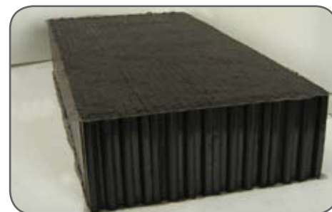
Standard bale of Stormcell® Lite

As part of our stormwater management package, HRD Technologies Ltd now offers Stormcell® Lite for the storage and infiltration of surface water drainage and SUDS schemes. Stormcell® Lite is a lightweight version ideal for installation beneath landscaped and non-trafficked areas.