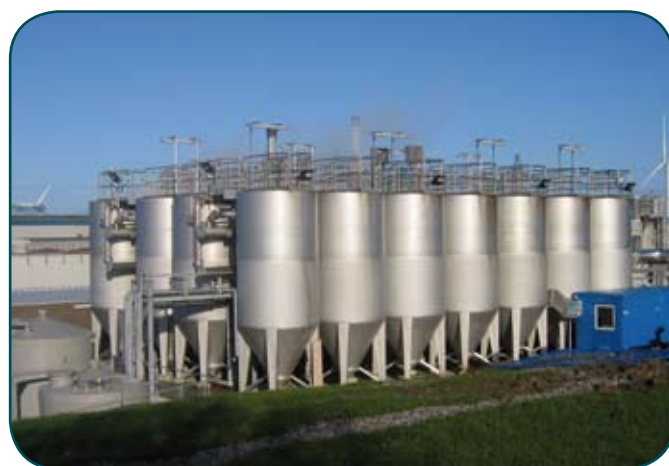
DynaSand® Filters continuously providing high quality process water to a box board manufacturing plant.