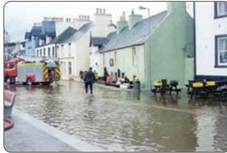
A flooding incident at Portpatrick.

The small harbour and fishing port of Portpatrick, opposite Belfast from the Galloway coastline, lies at the foot of a range of hills which catch the prevailing rain coming over Ireland from the Atlantic. To help alleviate flooding incidents from the Dinvin Burn, which runs through the centre of the village, Dumfries and Galloway Council have invested in an earth dam incorporating a 727 mm bore Type CX Hydro-Brake® Flow Control device to regulate the flow.