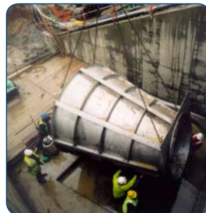
Installation of the Hydro-Brake® Flow Control at Weedon Dam.

Environmental sensitivity of any flood control solution was a crucial part of the scheme and the EA has made an arrangement with local farmers to allow their fields to flood behind the day during heavy rainfall to avoid damage downstream.