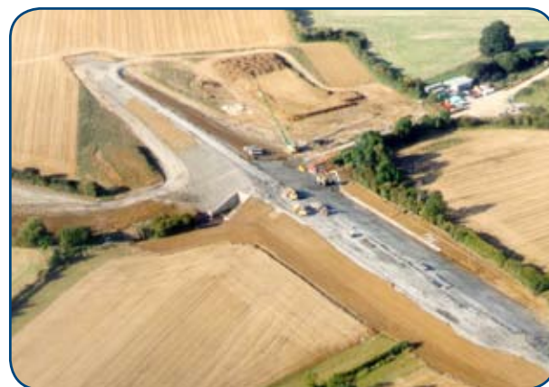
Aerial view of the dam during construction.

Further benefits of Hydro-Brake® Flow Controls are that they have no moving parts and need no power, so operating costs are very low. Openings can be up to six times the size of the equivalent flow orifice plates or penstocks, so are less prone to blocking and maintenance is therefore minimal.