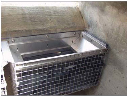
Curb inlet catch basin filter insert.