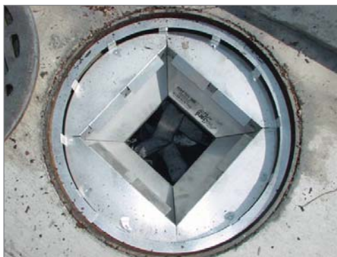
Round frame mounted catch basin filter insert.

* Dimensions shown are approximate. Submit exact measurements when ordering